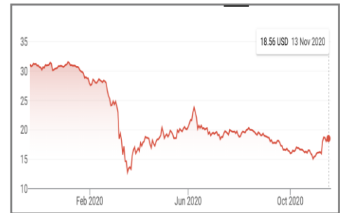
ETF Price in the last year

The International Energy Agency forecasts a huge increase in oil demand on 2021 with respect to 2020. As seen on the table, this will be a short-term growth.